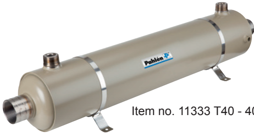
Item no. 11333 T40 - 40kW