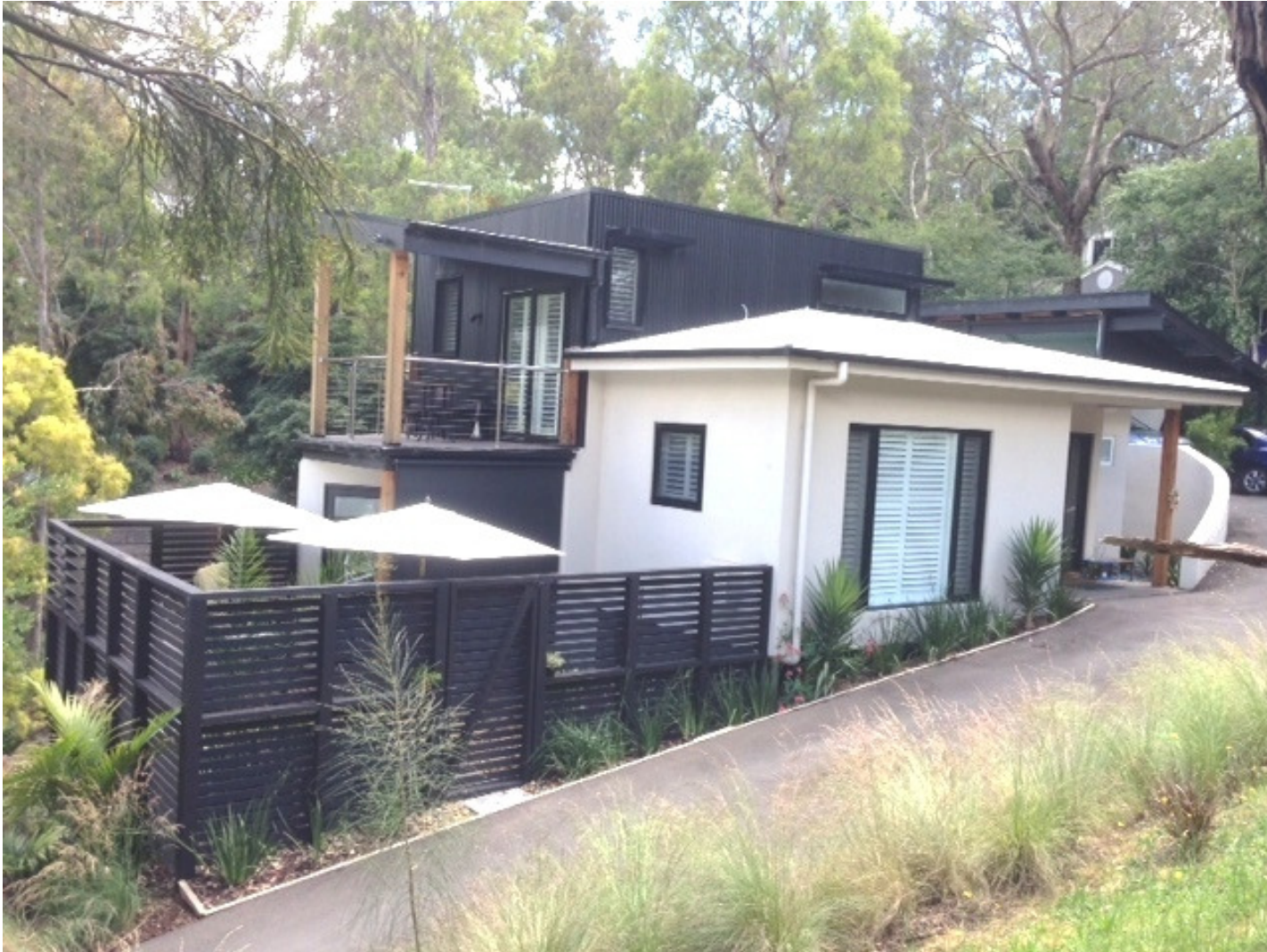
Our new sustainable home from the northern aspect .